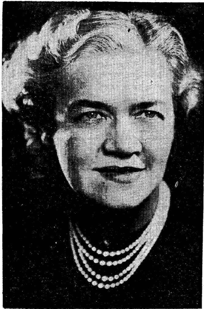
U. S. SENATOR MARGARET CHASE SMITH