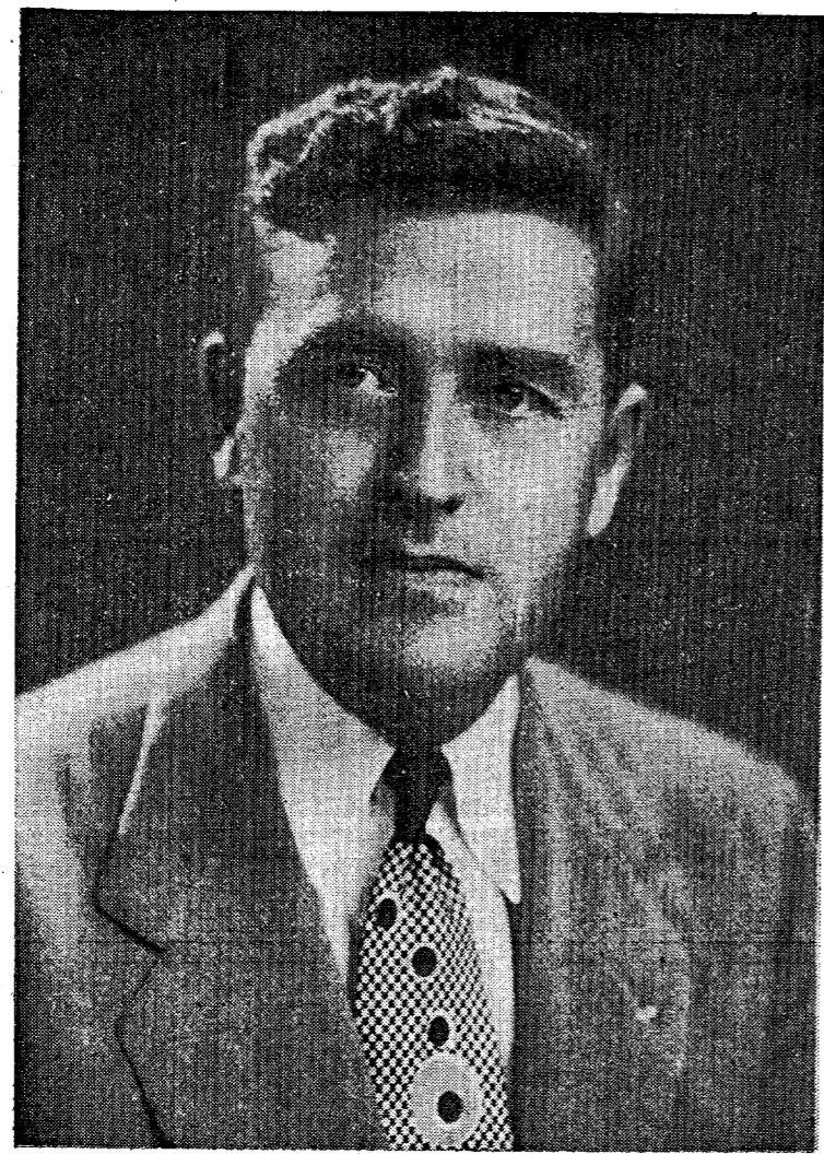
CONGRESSMAN CLIFFORD G. McINTIRE