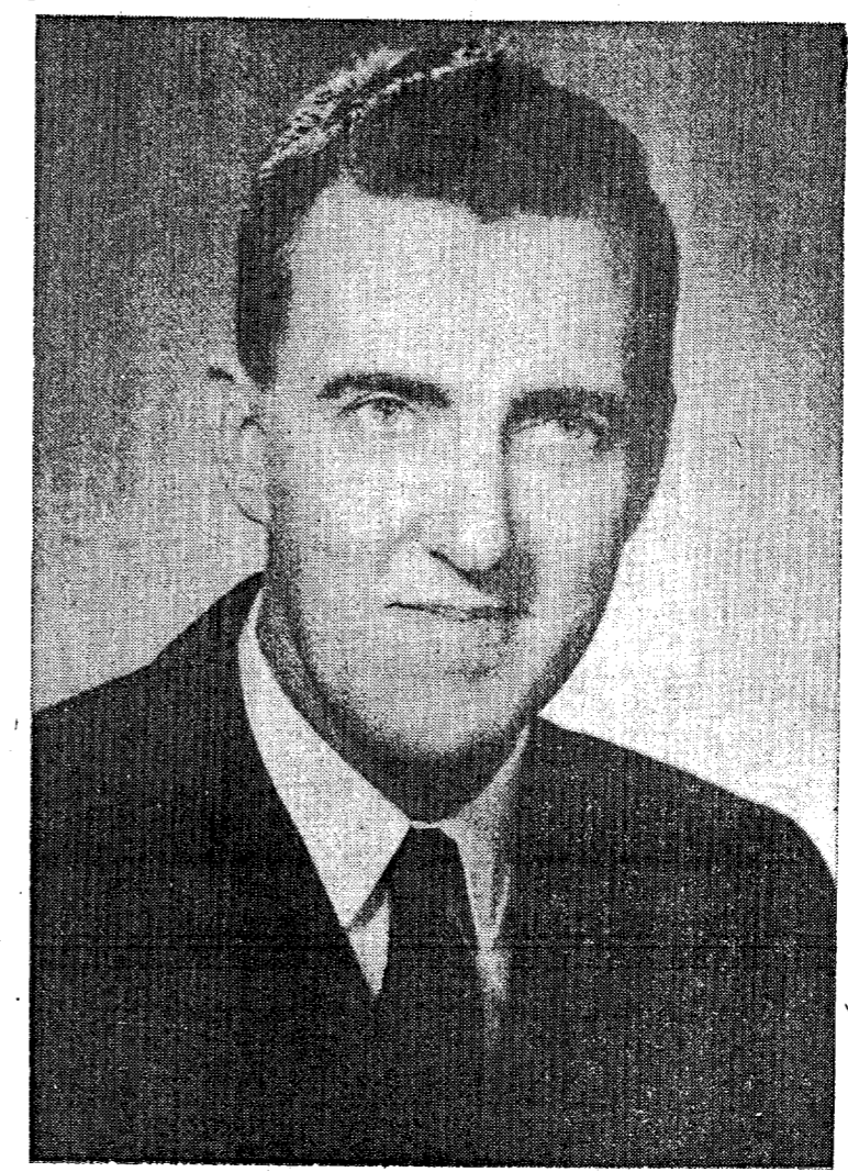
GOVERNOR EDMUND S. MUSKIE