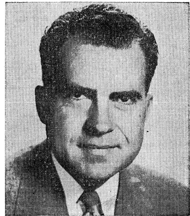
VICE PRESIDENT RICHARD M. NIXON

From the Vice President of the United States