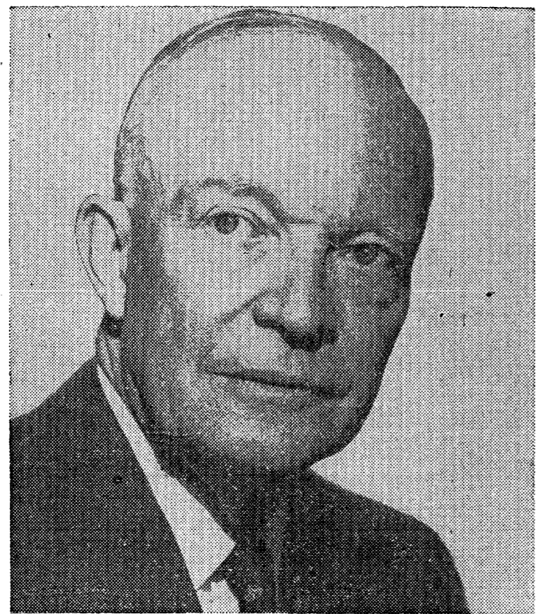
PRESIDENT DWIGHT D. EISENHOWER